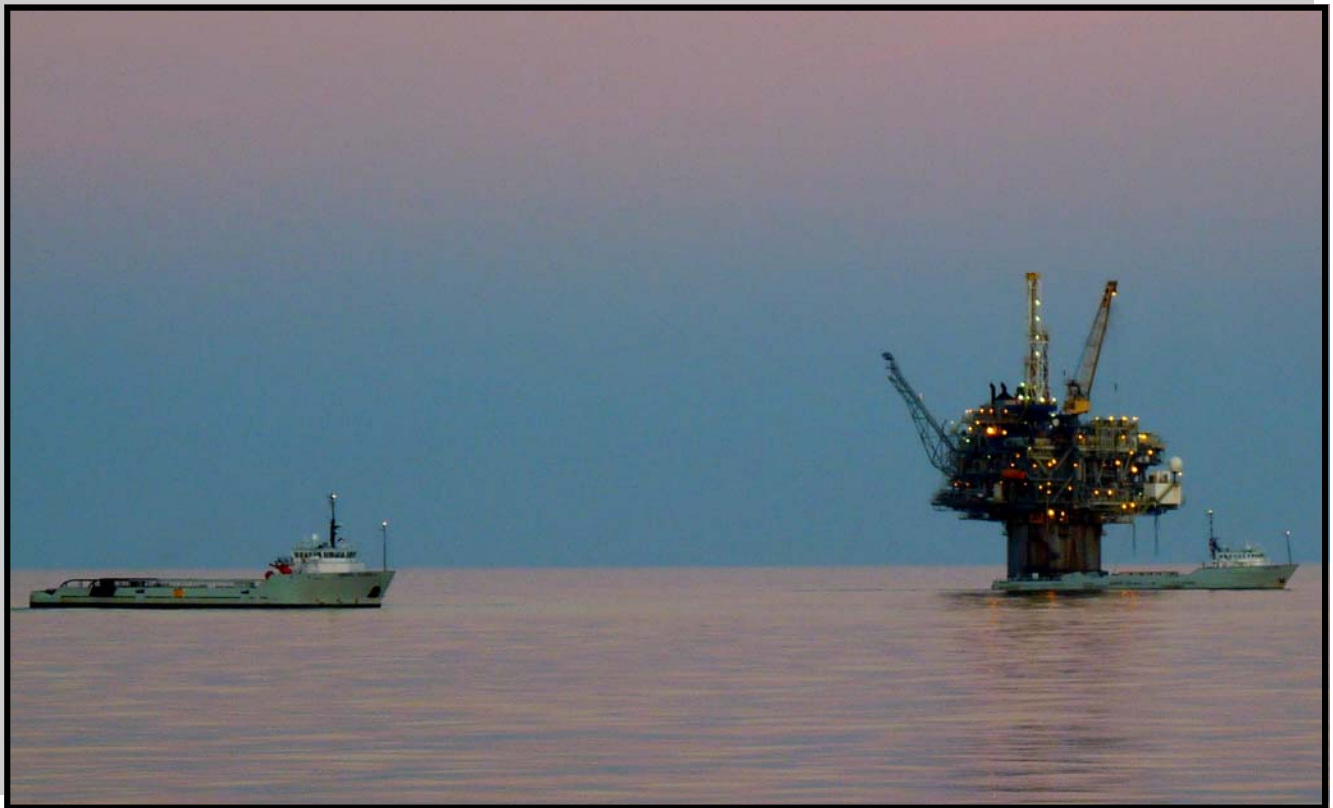
The M/V Abigail Claire (L) and the M/V Elsa Leigh (R) and the setting sun.