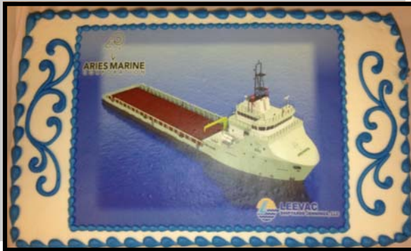
A cake to celebrate the new vessels was brought to the vendor kick-off meeting.