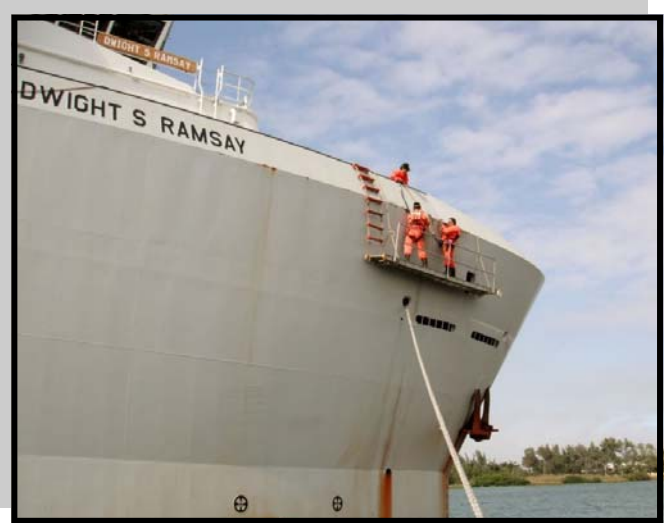
Working over the side of the M/V Dwight S. Ramsay .