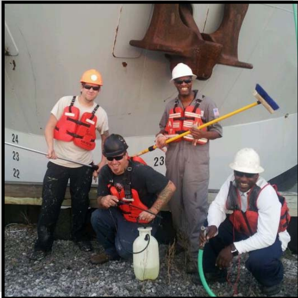
The M/V Betty Pfankuch's crew working hard.